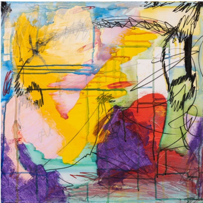
Thank God For Atheism Hic Et Nunc #644435 Acrylics, watercolors and marker on canvas