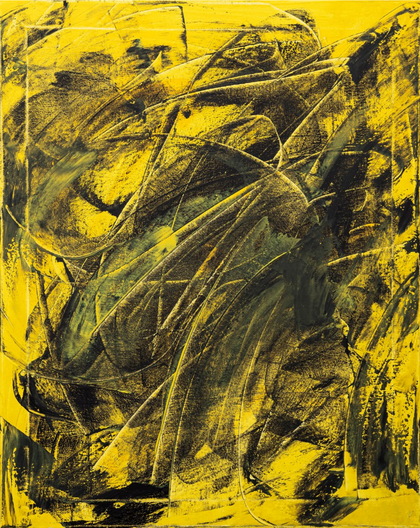
JPM Hic Et Nunc #568249 Acrylics on canvas