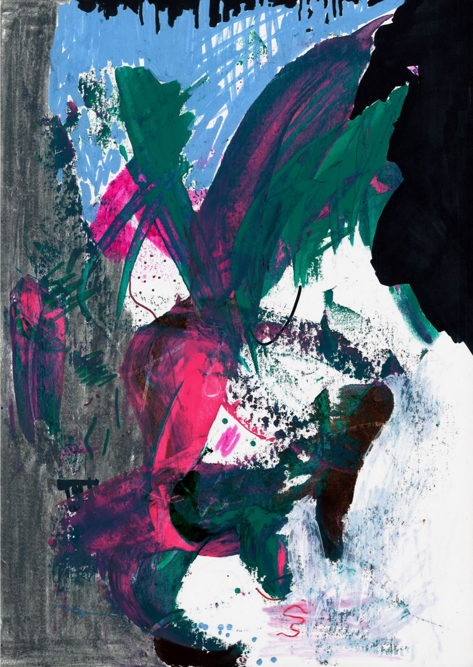
fruits Hic Et Nunc #425673 Acrylics, sumi ink and oil pastel on paper