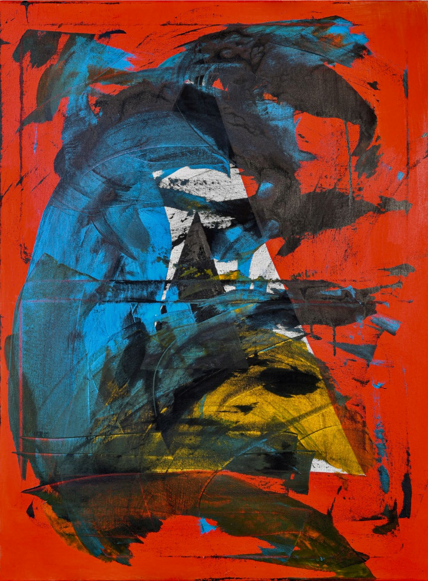
renovating Hic Et Nunc #534239 Acrylics and ink on canvas