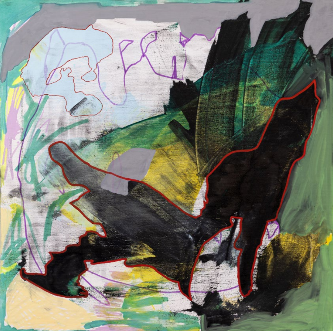
Cavolfiore Hic Et Nunc #624601 Acrylics on canvas