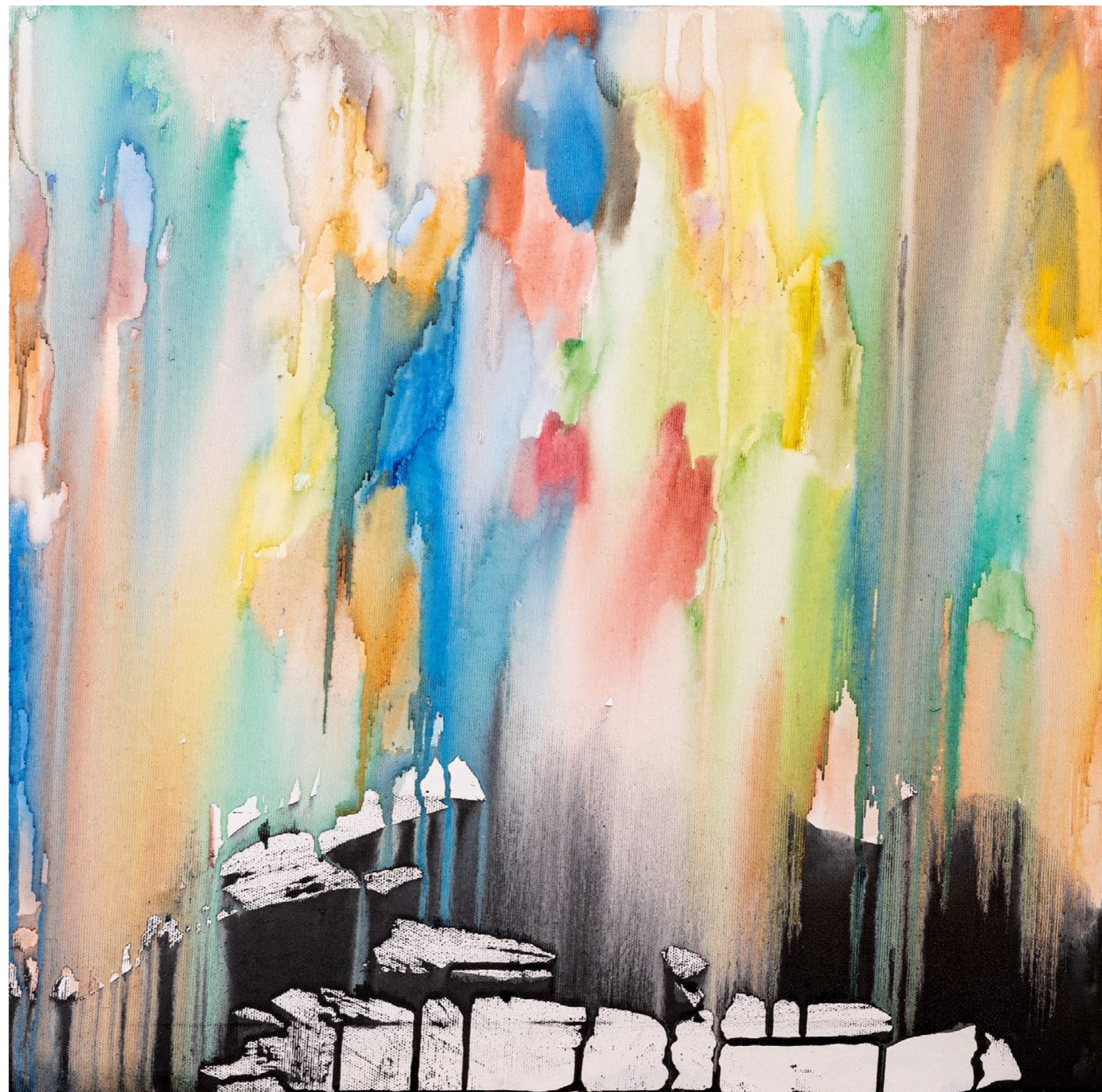
Acqua Santa #1 KnownOrigin Watercolors on canvas