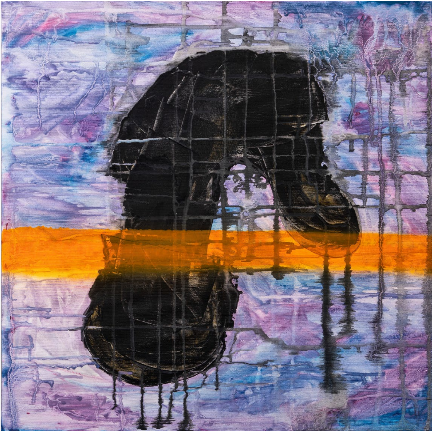
Acqua Santa #3 KnownOrigin Watercolors on canvas