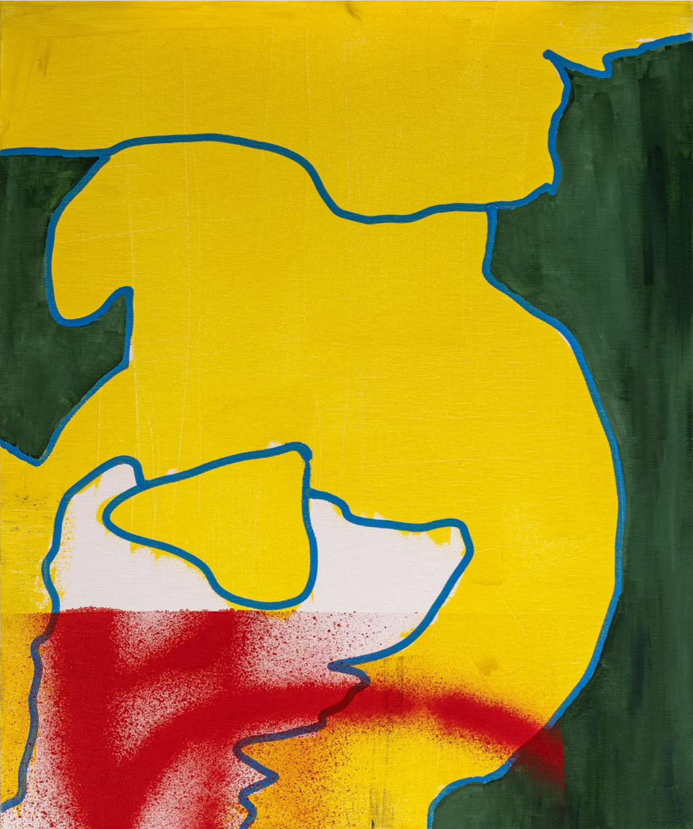
archetype ExchangeArt Spatulas, acrylics and spray on canvas