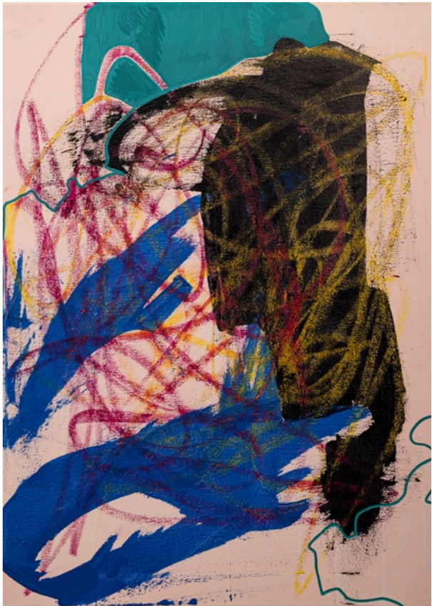
IOT Hic Et Nunc #568232 Oil pastels and sum ink on paper