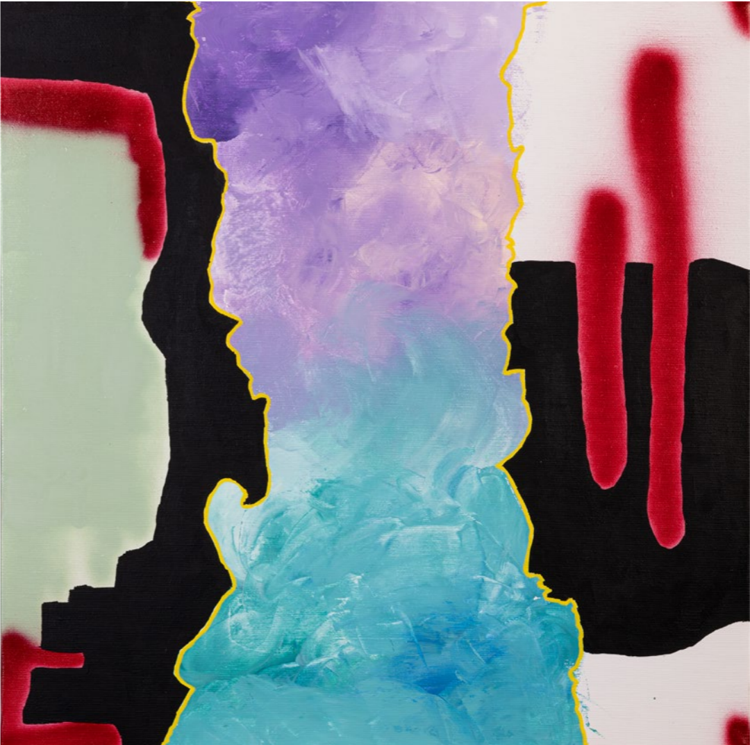
Collide Hic Et Nunc #655418 Acrylics and spray on canvas