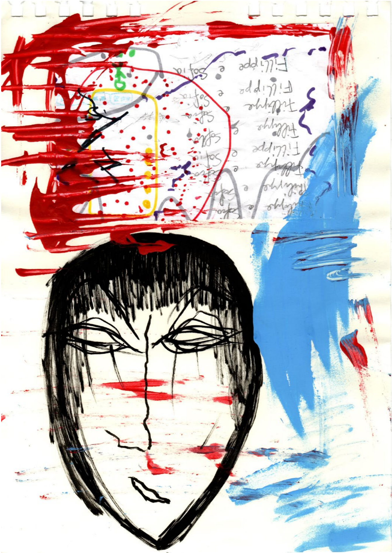
untitled Unpublished works