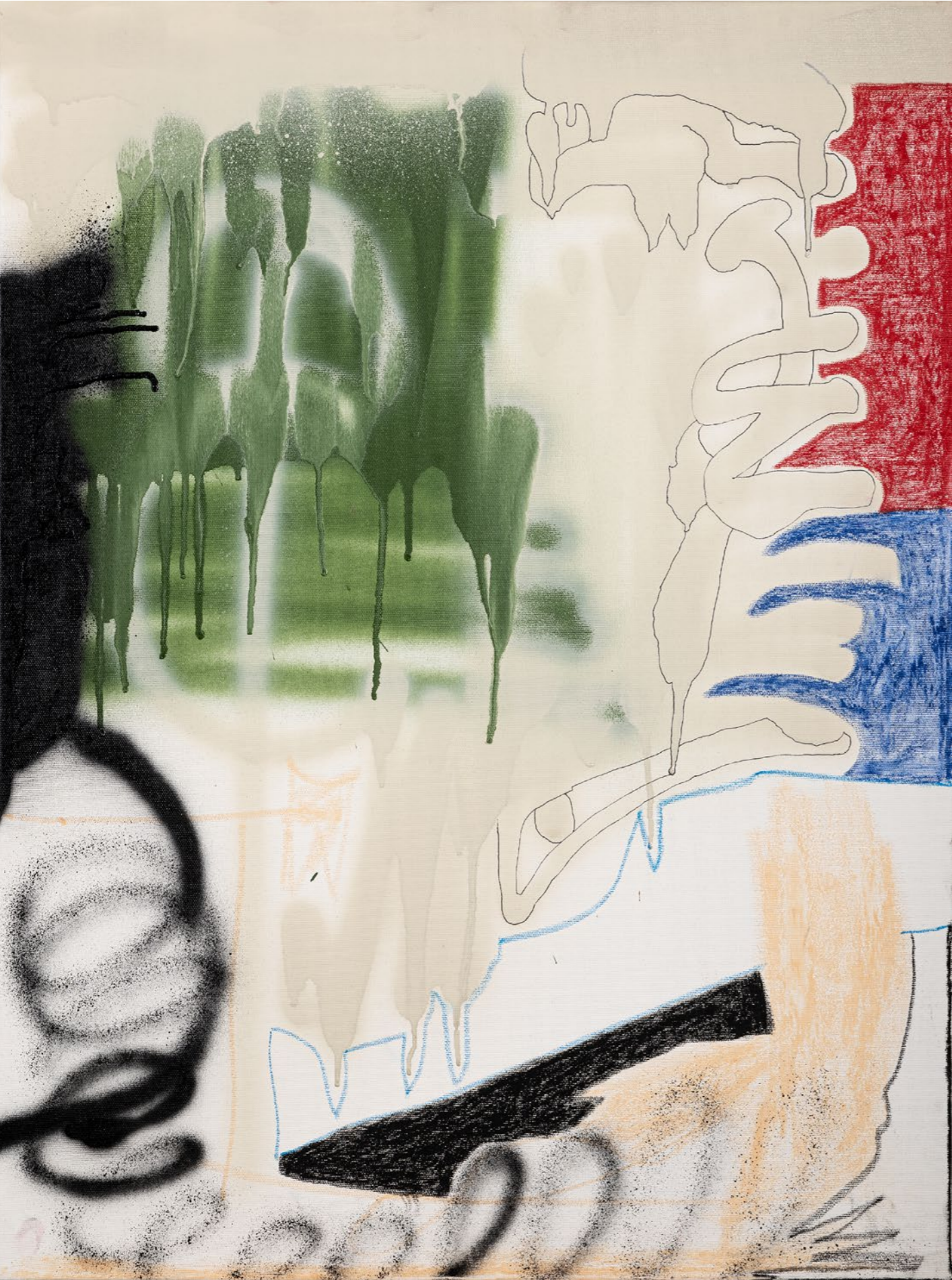
collarbones Hic Et Nunc #314390 Acrylics and spray on canvas