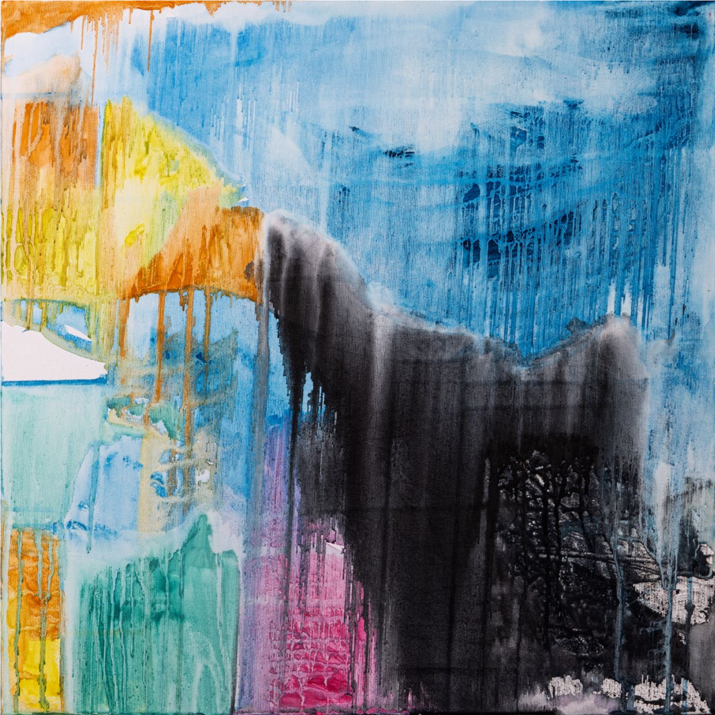
Acqua Santa #2 KnownOrigin Watercolors on canvas