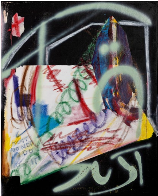
untitled Unpublished works