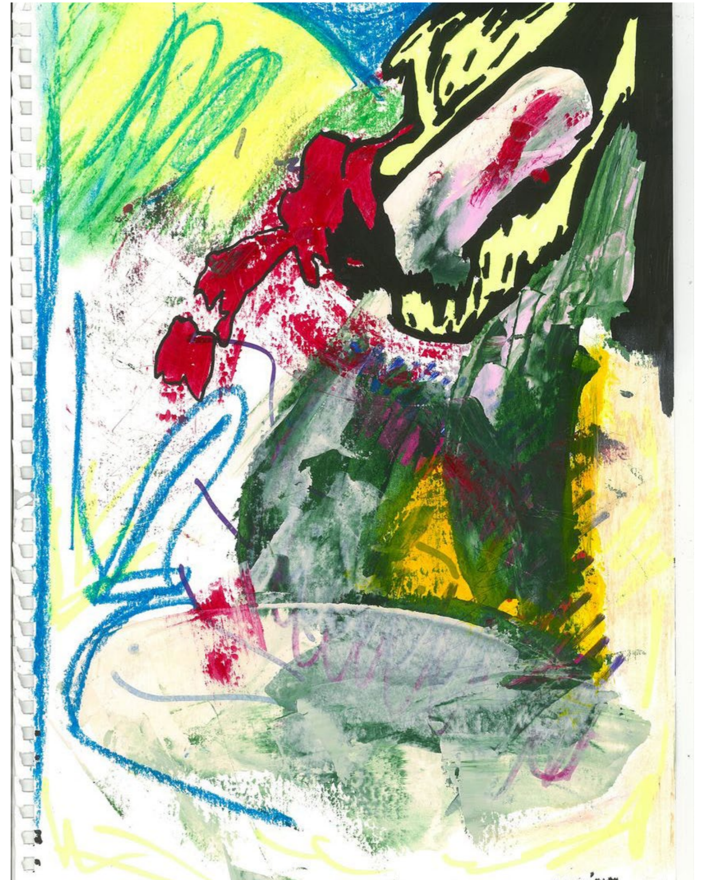
untitled Unpublished works