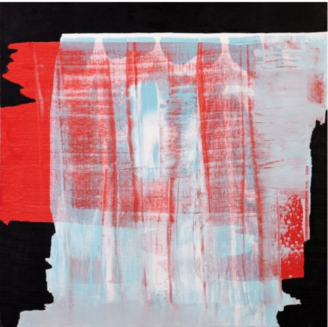
M Hic Et Nunc #671053 Acrylics on canvas