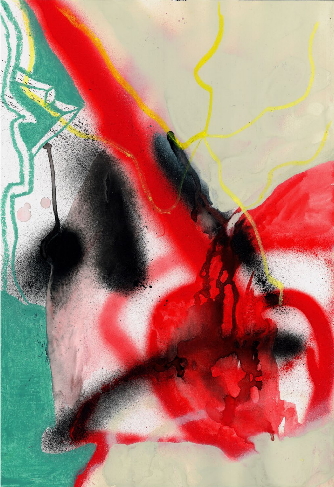
:P Hic Et Nunc #414418 Acrylics, oil paste and spray on paper