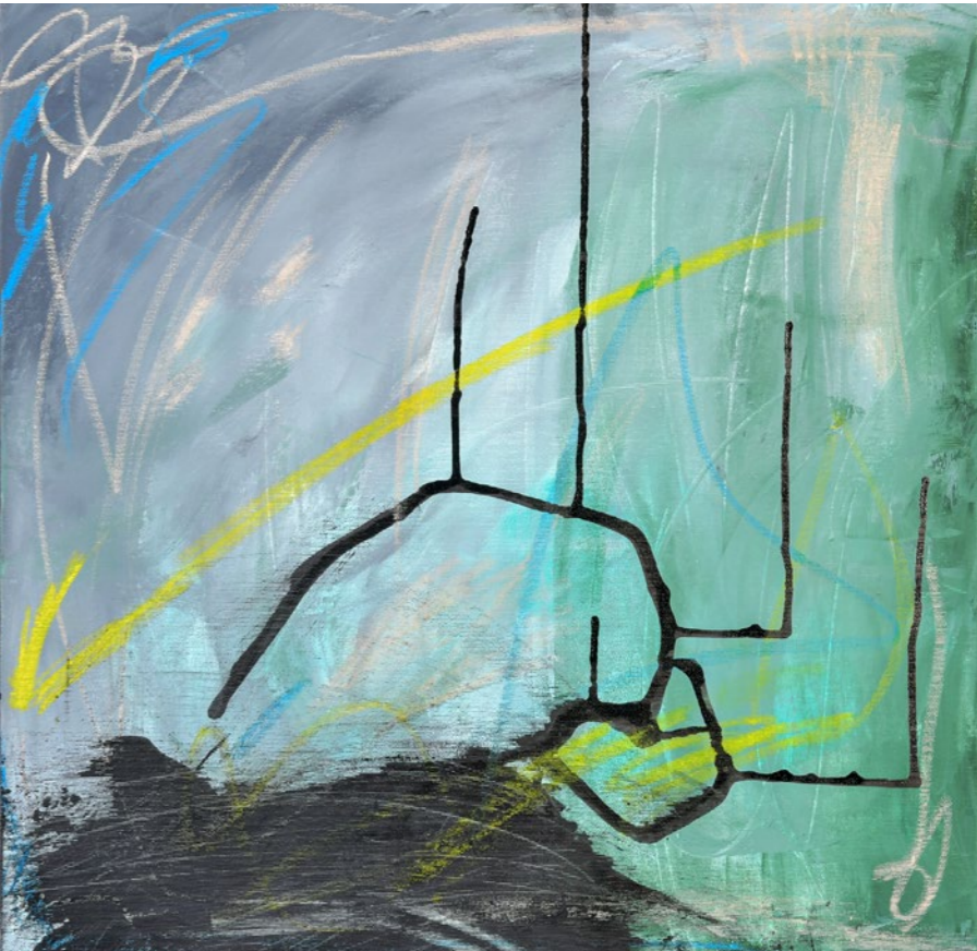
Bear Market Hic Et Nunc #542394 Acrylics, oil pastels and sumi ink on canvas