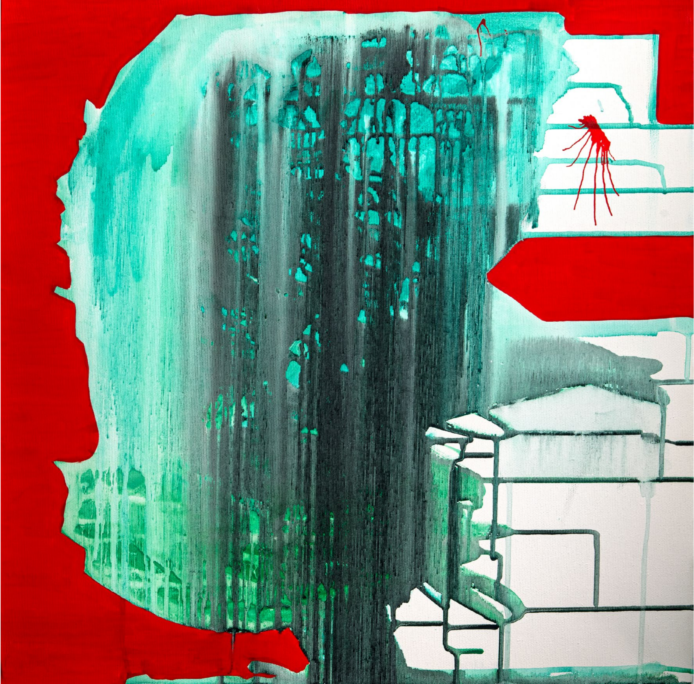
Acqua Santa #4 KnownOrigin Watercolors on canvas