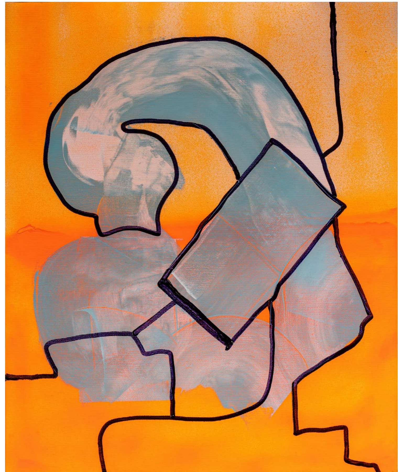
Ouroboros ExchangeArt Spatulas, acrylics and spray on canvas