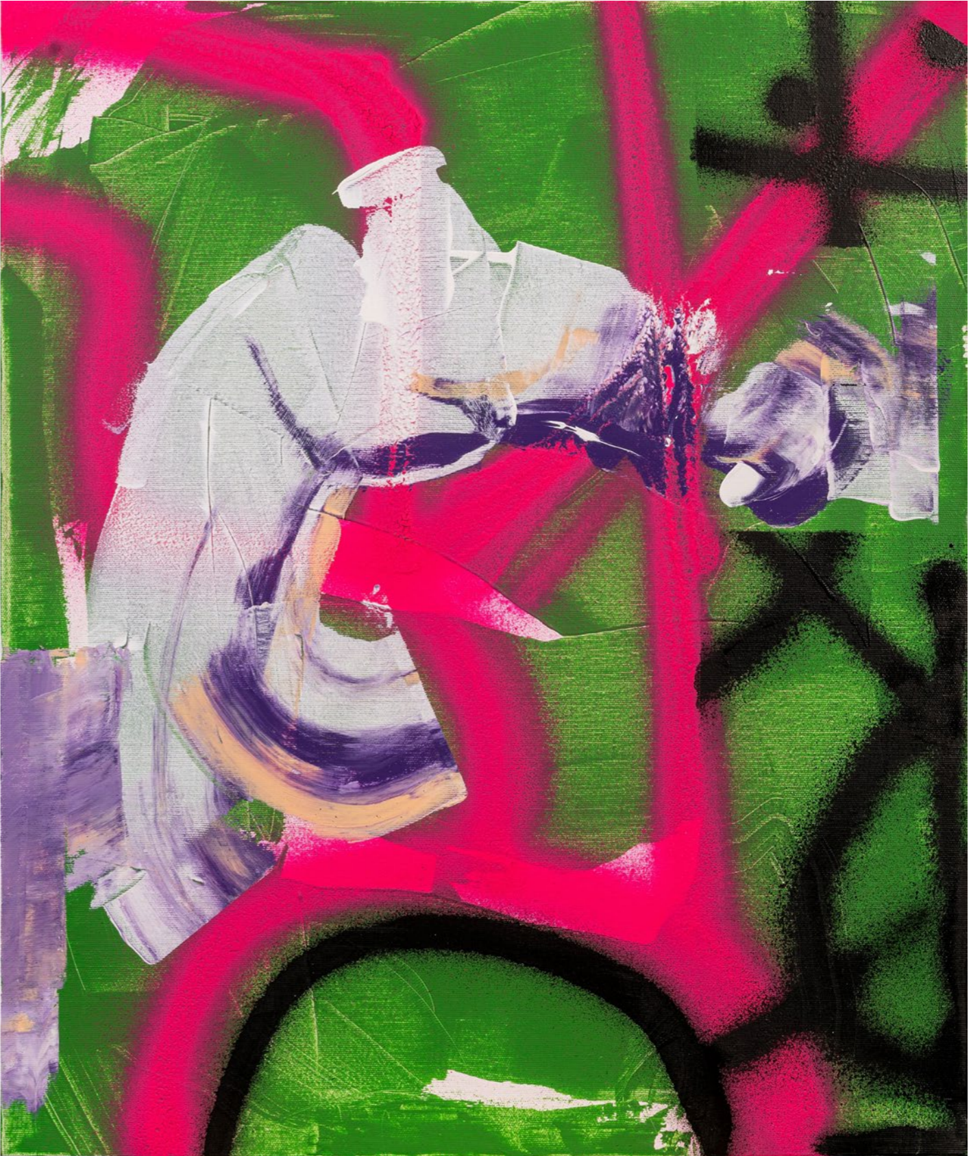
noise ExchangeArt Spatulas, acrylics and spray on canvas