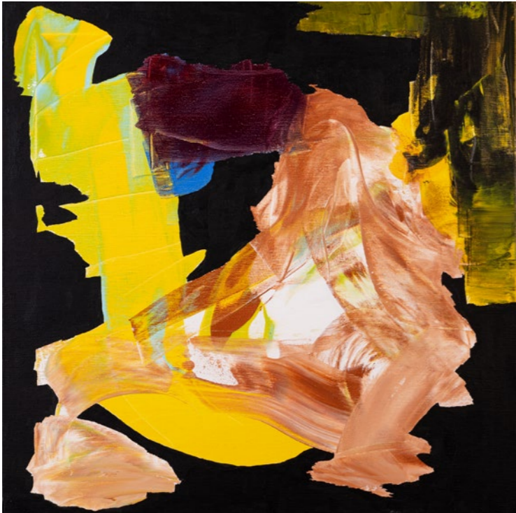
Polpa Hic Et Nunc #633184 Acrylics on canvas