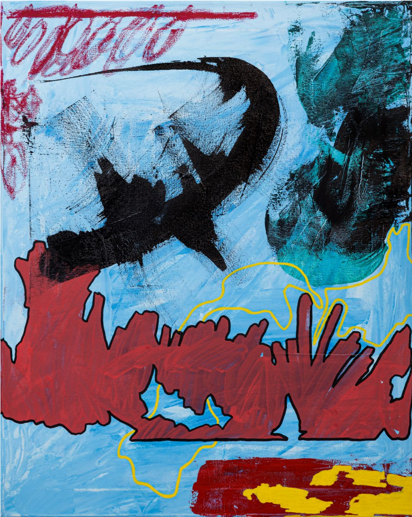
NYSE Hic Et Nunc #568239 Acrylics on canvas