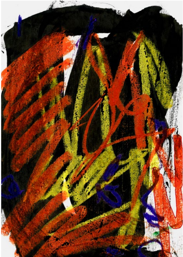
nudity Hic Et Nunc #395336 Oil pastels and sum ink on paper